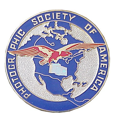
Volume 75 Issue 12

Panoram of the Oakland Camera Club Member of the Photographic Society of America and Northern California Councils of Camera Clubs