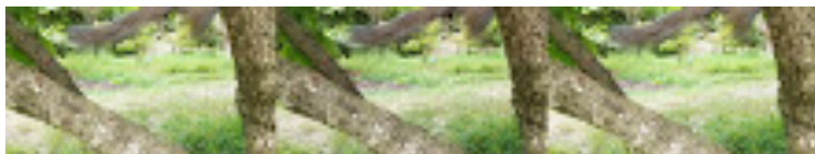
FlyingSquirrel Melinda Green Fourth Place