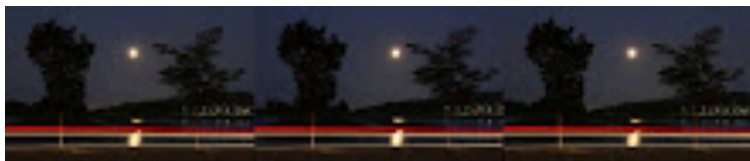
Passing Car Spoils Time Exposure Oleg Vorobyoff Second Place