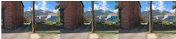
Alley View and Two Mountains Oleg Vorobyoff Third Place