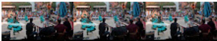
Honorable Mention: Oleg Vorobyoff - Dancing within the Arrow of Time