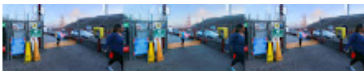
Honorable Mention: Oleg Vorobyoff - Gust of Wind at the Northeast Gate