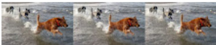
First Place: Melinda Green - Dog Train