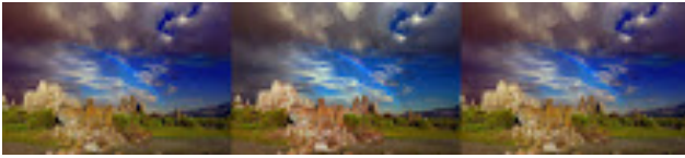
First Place: Oleg Vorobyoff - Rainbow Graces Mono Lake Tufas